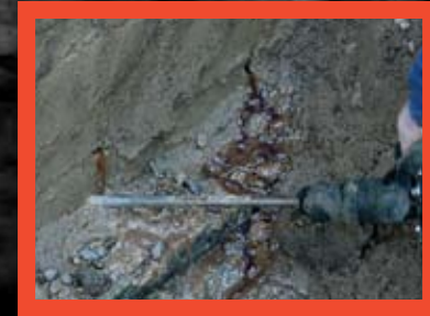
Earth below an oil tank spill.