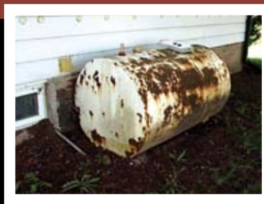
Aged Oil Tank

Caution: If you detect the odour of fuel oil, do not attempt to mask the odour with any type of masking agent. It is recommended that you find the source of the odour, take corrective action to eliminate any leaks and remove both surface and absorbed fuel oil.