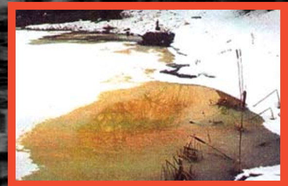
The damage can be extreme.